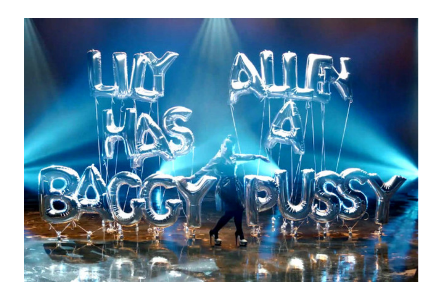
This Girl Can... Well, Let's Just Say Irony's A Bitch.